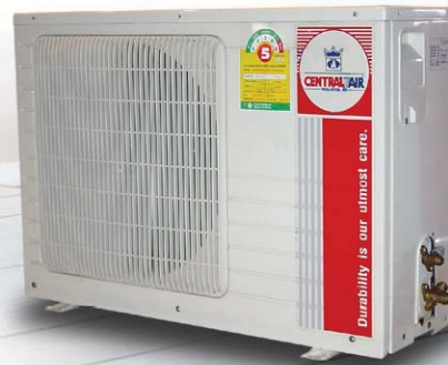
Model : CCS-EF 13, 15

Available for Wired Digital Temperature Display and Wireless remote controller