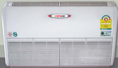
Model : CFH-EF 13, 18

เครื่องปรับอากาศ เซ็นทรัลแอร์ แบบตั้ง-แขวน