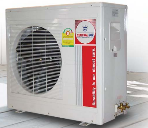
Model : CCS-EF 18, 20, 25, 28, 30 / CCS-2EF 25