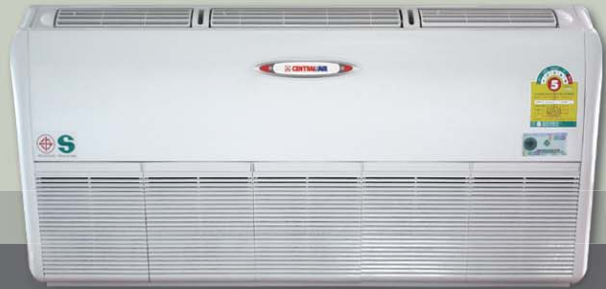
Model : CFH-EF 15, 20, 25, 28, 30 / CFH-2EF 25